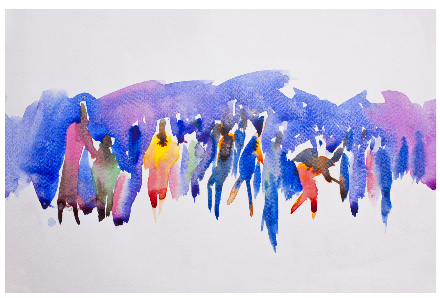
Who Does What: The Municipal Role in Public Health